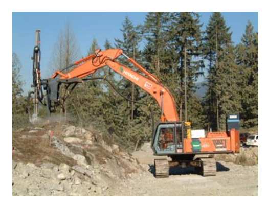
SBH-15 swing positioner mounted on a Traxxon excavator drill package.