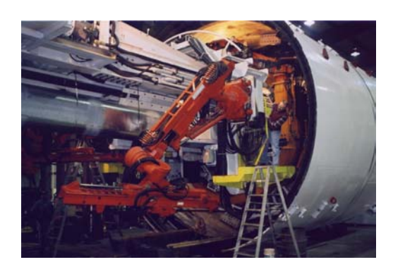
Traxxon fully articulating probing drill boom with SBH-15 positioners and 360° pedestal mounted on a tunnel boring machine.